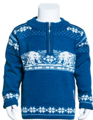
MODEL 560 COL 12 BLUE