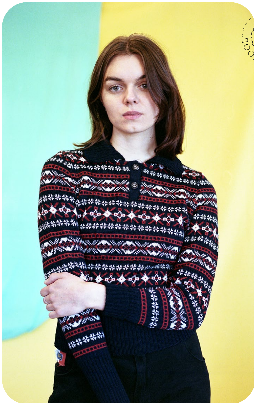
MODEL 356 COL 3 RED