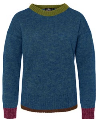
MODEL 357 COL 12 BLUE