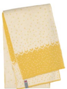
MODEL 249 COL 18 YELLOW