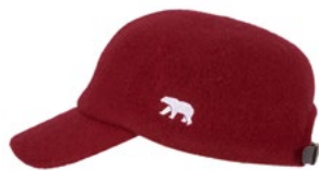
MODEL 282 COL 3 RED

Size ONE SIZE Fabric 65 % wool, 35% polyester