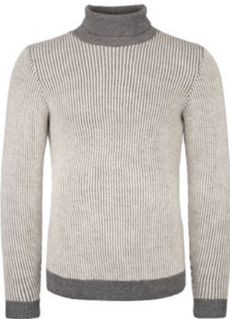
MODEL 369 COL 10 GREY