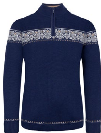
MODEL 348 COL 14 NAVY