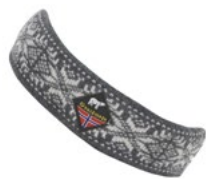
MODEL 402 COL 9 GREY / WHITE