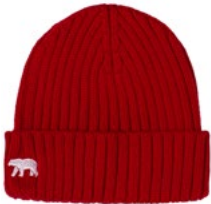
MODEL 272 COL 3 RED