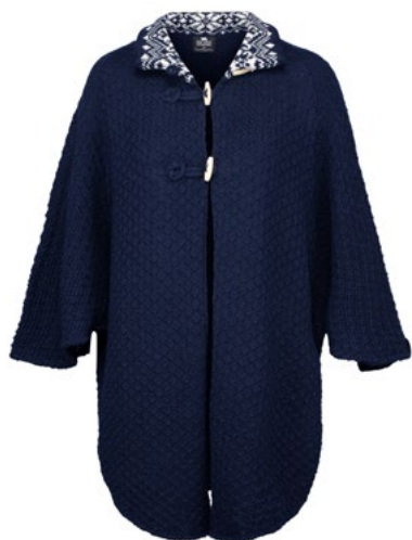
MODEL 605 COL 14 NAVY