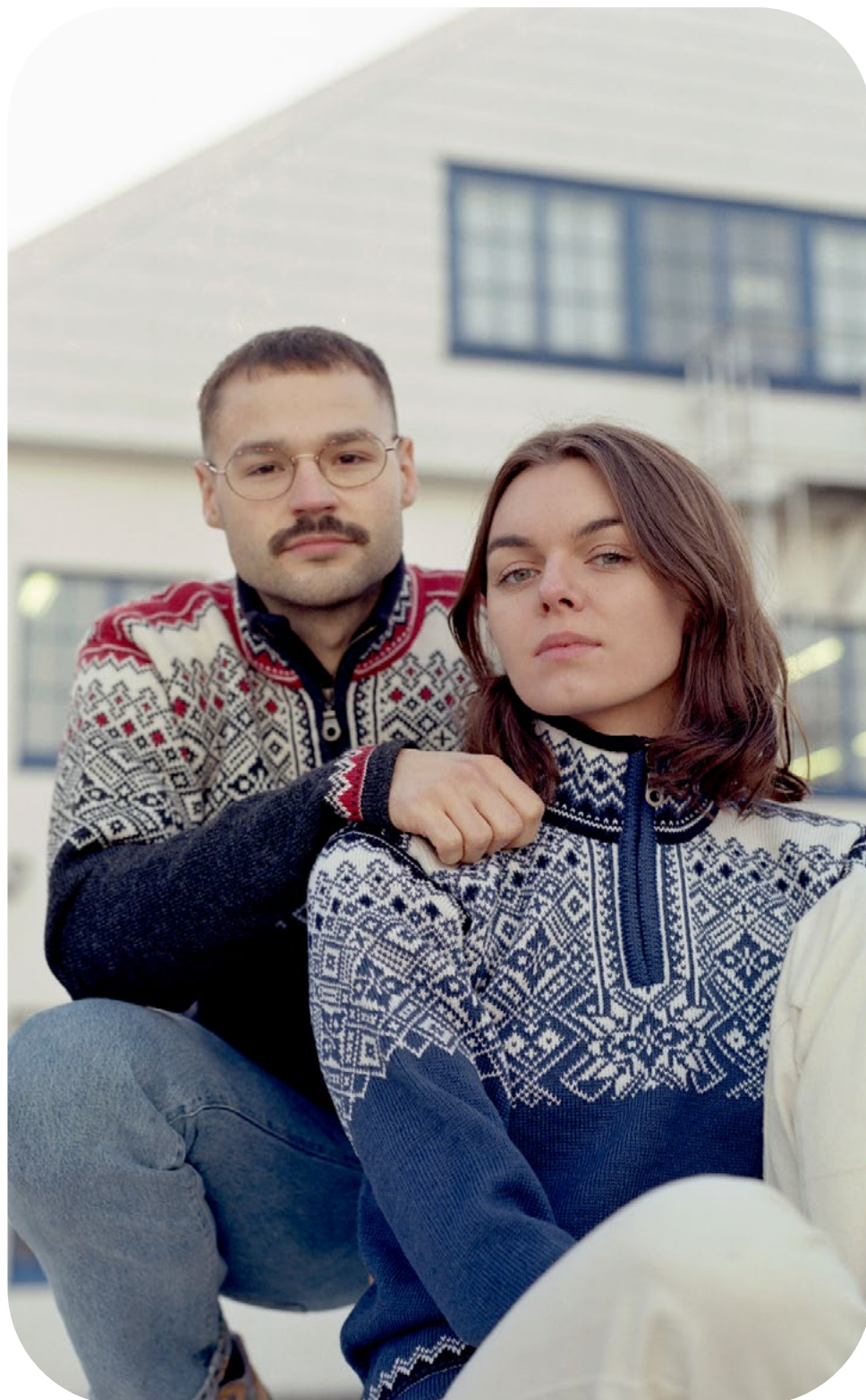
MODEL 312 COL 9 CHARCOAL