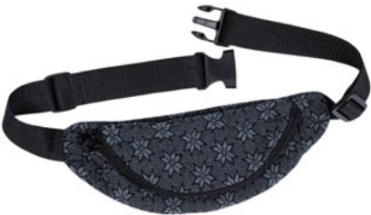
MODEL 110 COL 4 BLACK

Size 57 cm, 59 cm Gauge 7GG Yarn 100% fine merino wool