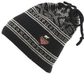
MODEL 244 COL 4 BLACK