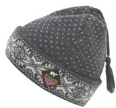
MODEL 401 COL 9 GREY / WHITE