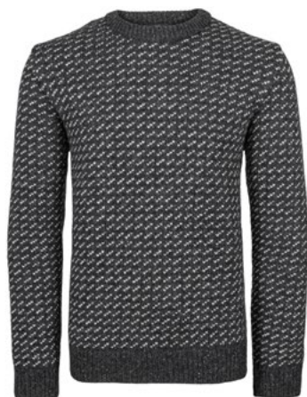
MODEL 379 COL 9 KOKS