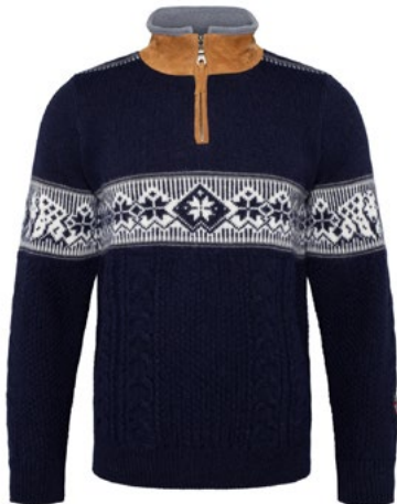
MODEL 366 COL 14 NAVY