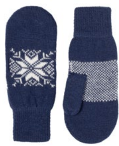
MODEL 405 COL 14 NAVY