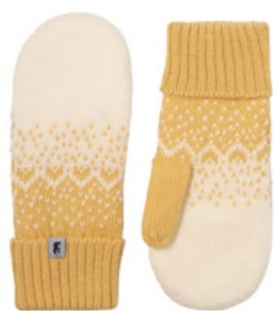
MODEL 248 COL 18 YELLOW