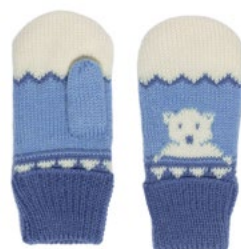
MODEL 236 COL 12 BLUE