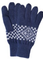
MODEL 209 COL 14 NAVY