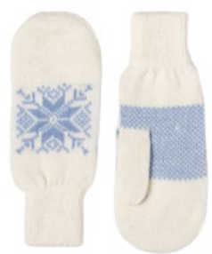
MODEL 405 COL 1 WHITE / BLUE