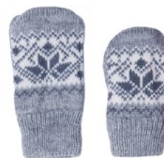
MODEL 258 COL 10 GREY