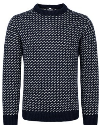
MODEL 379 COL 14 NAVY