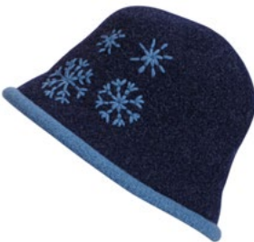
MODEL 295 COL 14 NAVY

Size 57 cm Fabric 65% wool, 35% polyester