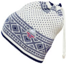
MODEL 244 COL 1 WHITE