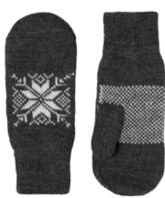
MODEL 405 COL 9 GREY / WHITE