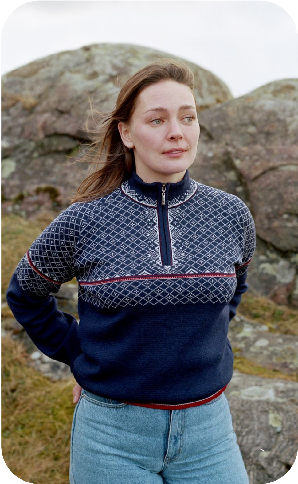
MODEL 323 COL 1 WHITE