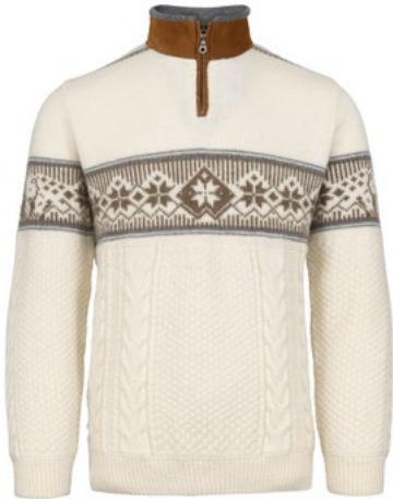
MODEL 366 COL 2 OFF-WHITE