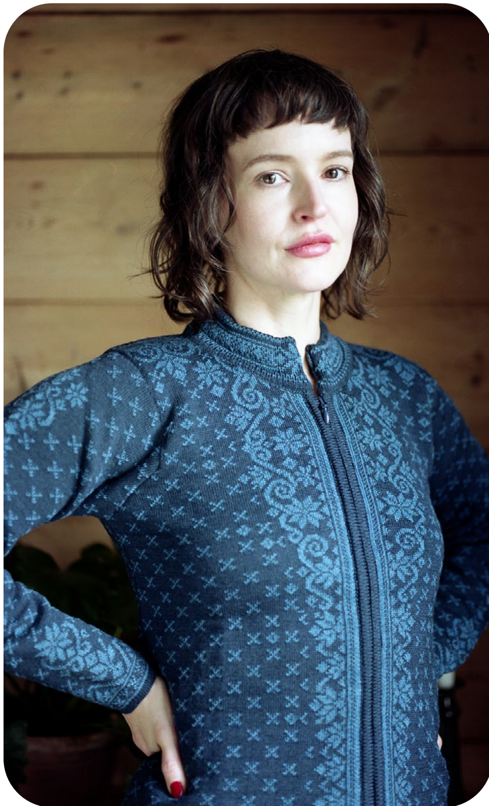
MODEL 653 COL 2 OFF-WHITE / BLUE