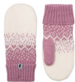
MODEL 248 COL 19 PINK