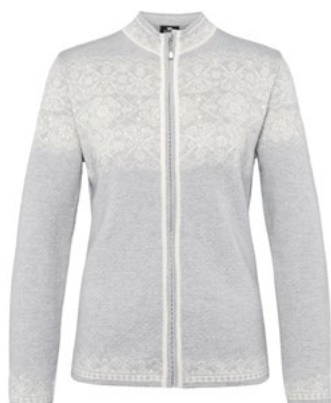
MODEL 627 COL 10 GREY