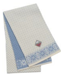
MODEL 404 COL 1 WHITE / BLUE