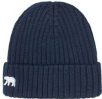
MODEL 272 COL 14 NAVY