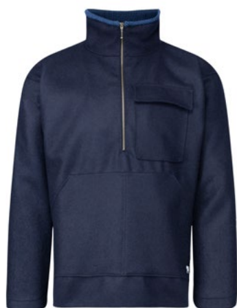
MODEL 655 COL 14 NAVY