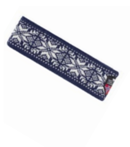
MODEL 402 COL 14 NAVY