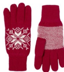
MODEL 403 COL 3 RED / WHITE