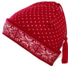
MODEL 401 COL 3 RED / WHITE