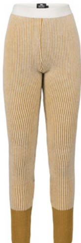
MODEL 469 COL 18 OCHRE