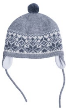
MODEL 257 COL 10 GREY