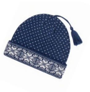
MODEL 401 COL 14 NAVY