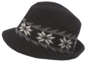
MODEL 291 COL 4 BLACK

Size 56 cm, 58 cm & 60 cm Fabric 60% polyester, 40% wool