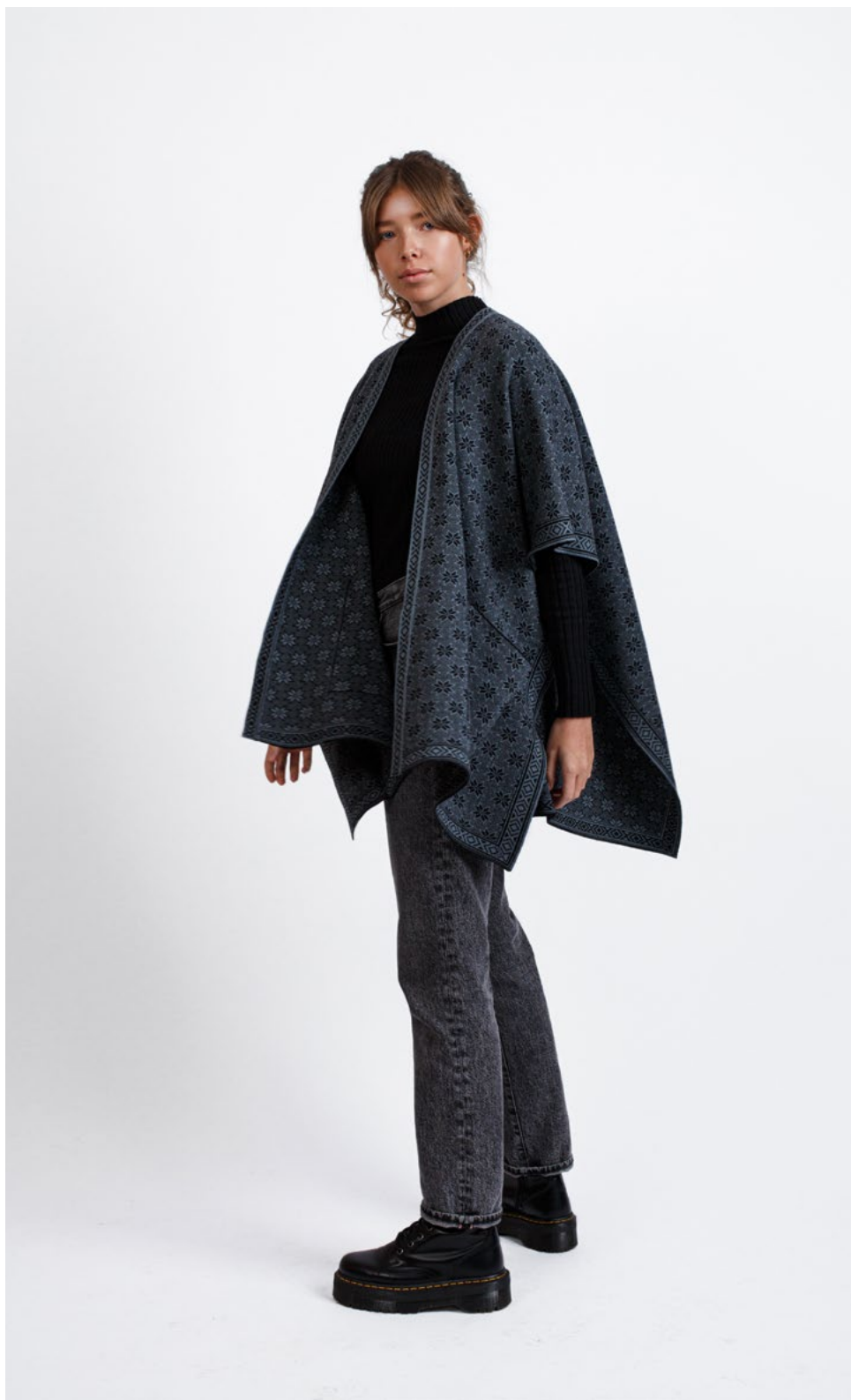
MODEL 602 COL 9 CHARCOAL