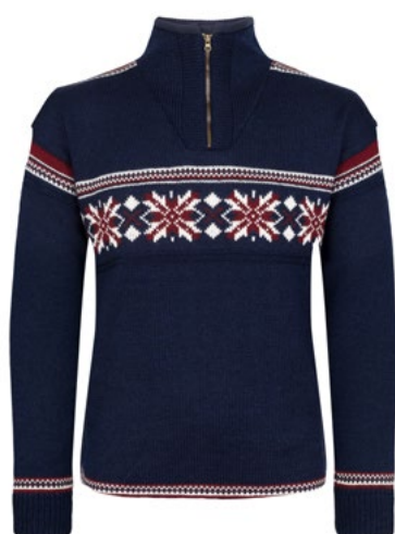
MODEL 329 COL 14 NAVY

Size S-XXL Gauge 5 GG Stitch Single bed jacquard Yarn 100% worsted wool