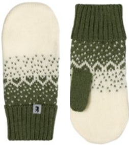
MODEL 248 COL 13 GREEN