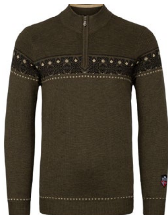
MODEL 348 COL13 GREEN