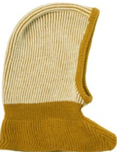
MODEL 270 COL 18 OCHRE