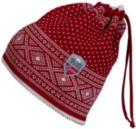
MODEL 244 COL 3 RED