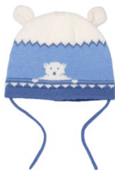
MODEL 235 COL 12 BLUE