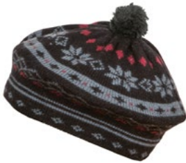
MODEL 226 COL 4 BLACK

Size ONE SIZE Gauge 7GG Stitch Tubular knitted jacquard Yarn 100% extra fine merino wool