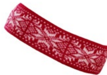
MODEL 402 COL 3 RED / WHITE