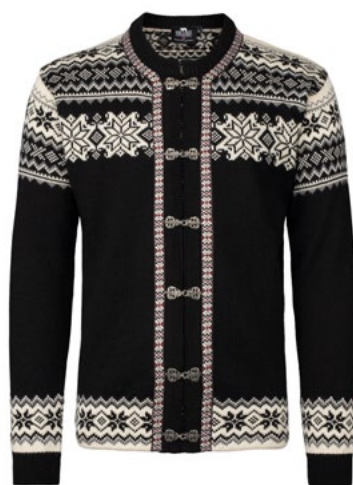
MODEL 644 COL 4 BLACK