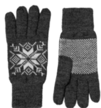
MODEL 403 COL 4 BLACK / GREY