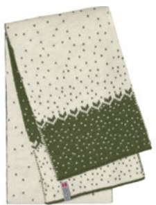
MODEL 249 COL 13 GREEN