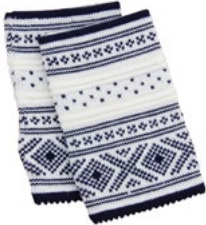
MODEL 246 COL 1 WHITE