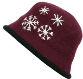
MODEL 295 COL 5 BURGUNDY

Size 57 cm Fabric 65% wool, 35% polyester