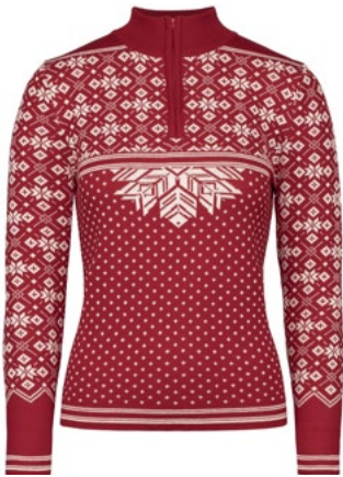
MODEL 335 COL 3 RED

Made from 100% extra fine merino wool, this quarter-zip sweater has a lightweight feel. The decorative snow crystal design on the front, gives the sweater a sporty and contemporary look.