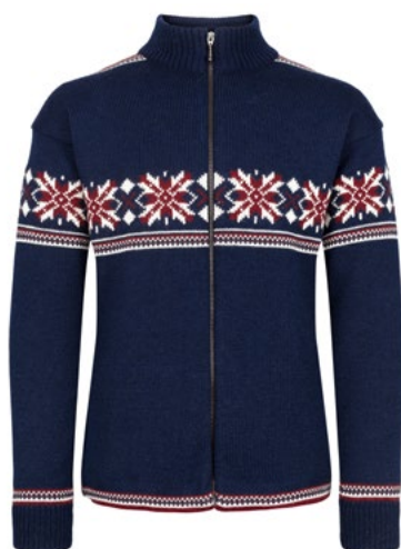
MODEL 629 COL 14 NAVY