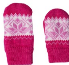
MODEL 258 COL 21 CERISE

Size 1-2, 3-6 yrs Gauge 5 GG Stitch Single bed jacquard Yarn 100% worsted wool