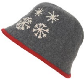
MODEL 295 COL 10 GREY

Size 57 cm Fabric 65% wool, 35% polyester