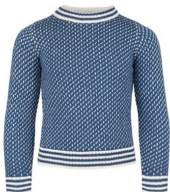
MODEL 563 COL 12 BLUE / OFF-WHITE