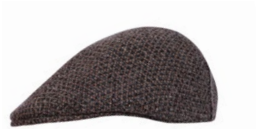
MODEL 269 COL 15 CAMEL