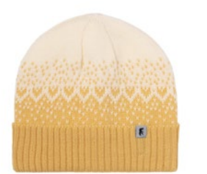
MODEL 247 COL 18 YELLOW