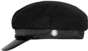
MODEL 266 COL 4 BLACK

Size 57 cm, 59 cm Fabric 30% wool, 70% polyester