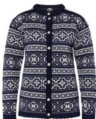
MODEL 620 COL 14 NAVY