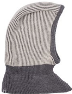
MODEL 270 COL 9 CHARCOAL