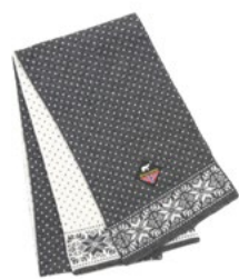
MODEL 404 COL 9 GREY / WHITE