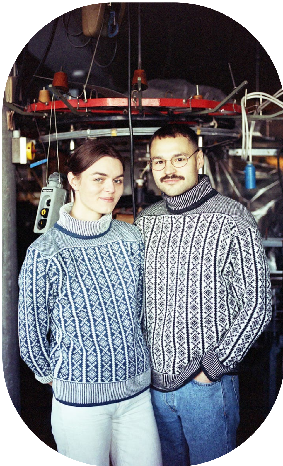
MODEL 368 COL 9 CHARCOAL / OFF-WHITE