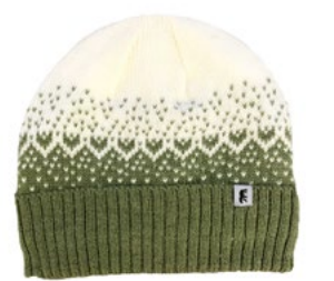
MODEL 247 COL 13 GREEN