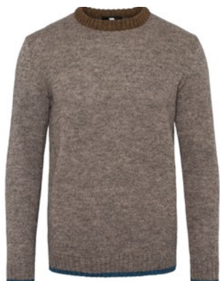
MODEL 358 COL 11 GREY MELANGE