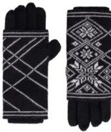
MODEL 293 COL 4 BLACK / WHITE