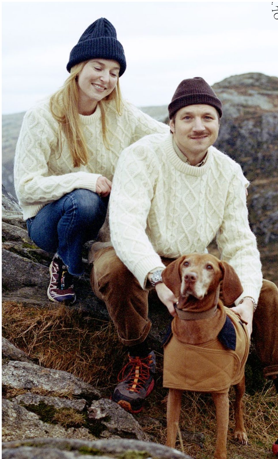
MODEL 380 COL 2 OFF-WHITE