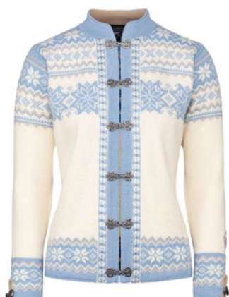
MODEL 640 COL 12 BLUE / WHITE