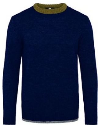
MODEL 358 COL 14 NAVY