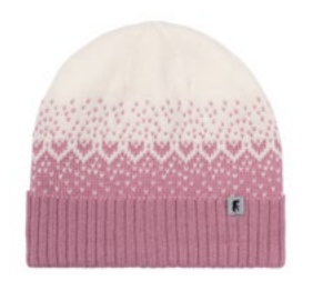
MODEL 247 COL 19 PINK