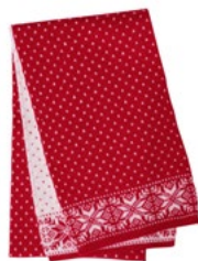
MODEL 404 COL 3 RED / WHITE