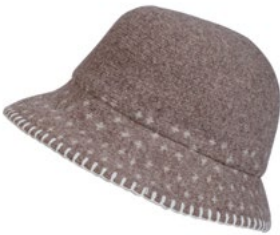
MODEL 283 COL 17 BEIGE

Size 56 cm, 58 cm & 60 cm Fabric 60% polyester, 40% wool