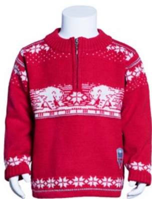
MODEL 560 COL 3 RED

Inspired by the majestic polar bears living on Svalbard, Kvitebjørn has a polar bear pattern at the front and back. This is a lightweight sweater with a half zip opening.