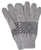
MODEL 209 COL 10 GREY