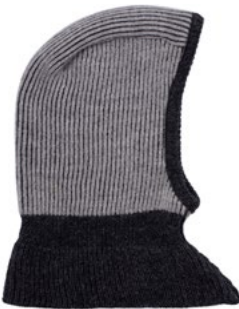
MODEL 270 COL 10 GREY