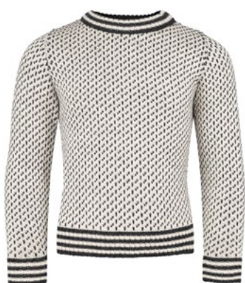
MODEL 563 COL 2 OFF-WHITE / CHARCOAL