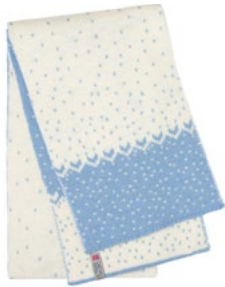
MODEL 249 COL 12 BLUE