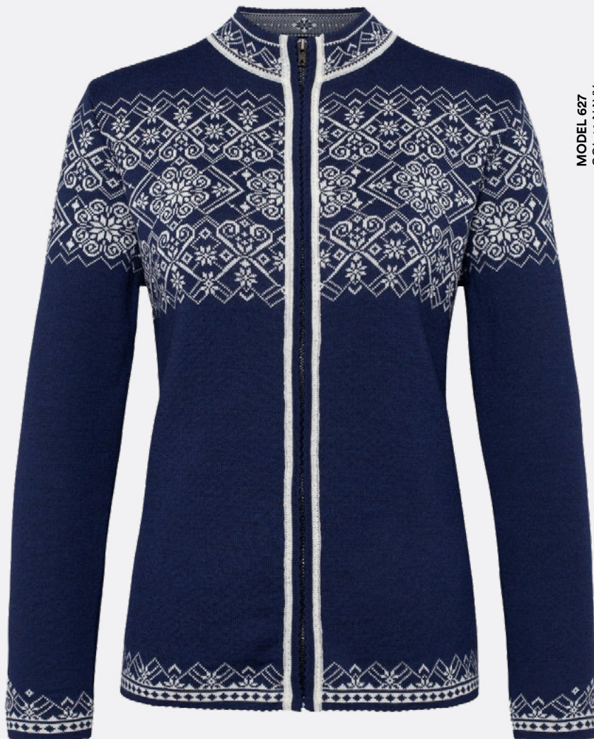
MODEL 627 COL 14 NAVY

Size XS-XXL Gauge 12 GG Stitch Tubular knitted jacquard Yarn 100% extra fine merino wool