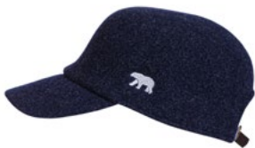
MODEL 282 COL 14 NAVY