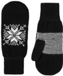
MODEL 405 COL 4 BLACK / WHITE

Size ONE SIZE Gauge 7 GG Stitch Single bed jacquard Yarn 100% worsted wool