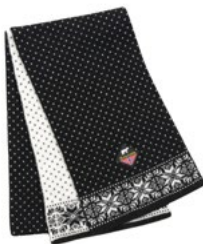
MODEL 404 COL 4 BLACK / WHITE