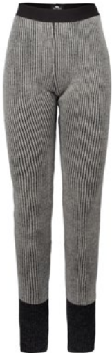
MODEL 469 COL 9 CHARCOAL