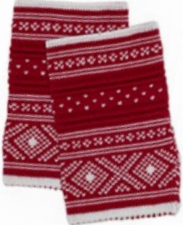
MODEL 246 COL 3 RED