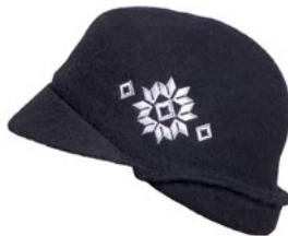
MODEL 285 COL 4 BLACK

Size 57 cm Fabric 40% wool, 40% acrylic & 20 %polyester