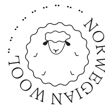
MODEL 621 COL 12 BLUE / WHITE