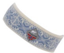
MODEL 402 COL 1 WHITE / BLUE