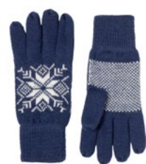
MODEL 403 COL 14 NAVY