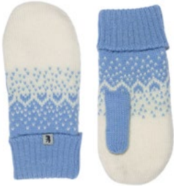
MODEL 248 COL 12 BLUE