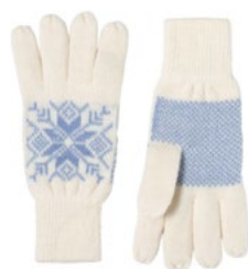
MODEL 403 COL 1 WHITE / BLUE