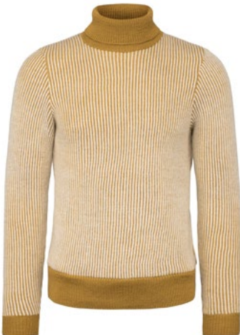
MODEL 369 COL 18 OCHRE