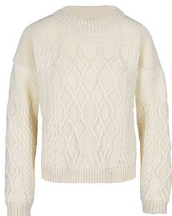
MODEL 381 COL 2 OFF-WHITE