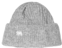
MODEL 238 COL 10 GREY

Size ONE SIZE Gauge 5 GG Stitch Rib knit Yarn 100% carded wool