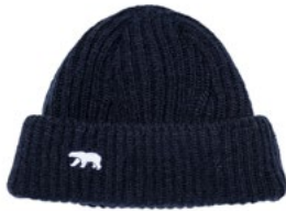
MODEL 238 COL 14 NAVY