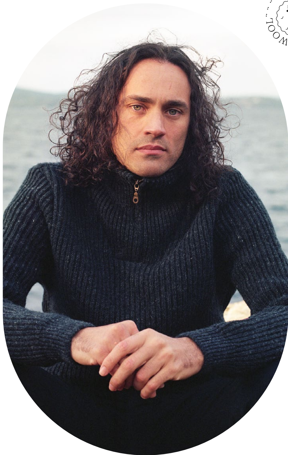
MODEL 382 COL 9 CHARCOAL