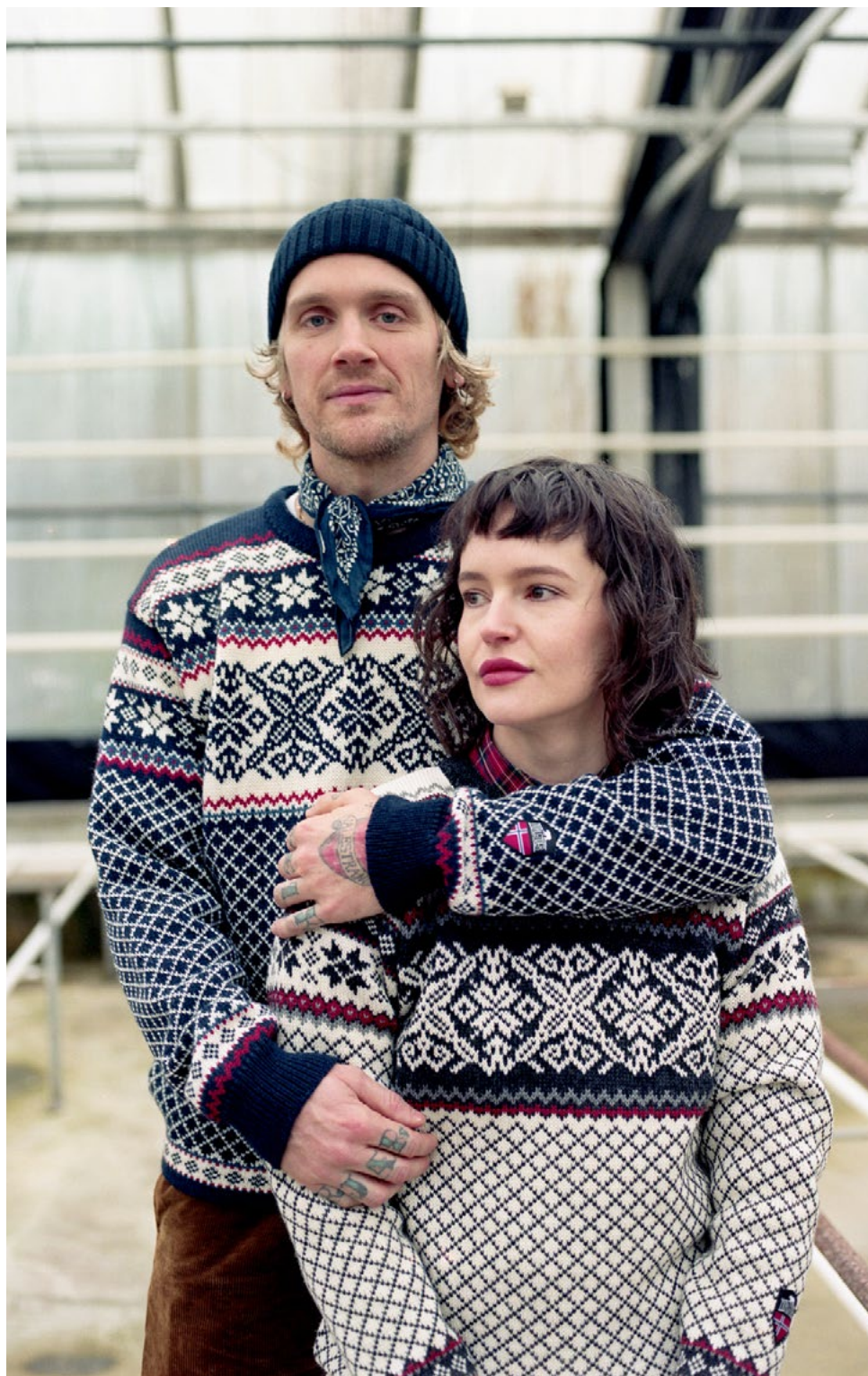
MODEL 341 COL 2 OFF-WHITE / CHARCOAL