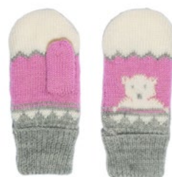
MODEL 236 COL 19 PINK

Size 3-6 yrs Gauge 5 GG Stitch Single bed jacquard Yarn 100% worsted wool