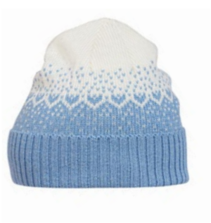
MODEL 247 COL 12 BLUE

Size ONE SIZE Gauge 5 GG Stitch Single bed jacquard Yarn 100% worsted wool