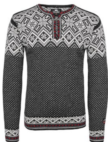
MODEL 343 COL 9 CHARCOAL