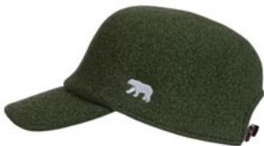
MODEL 282 COL 13 GREEN