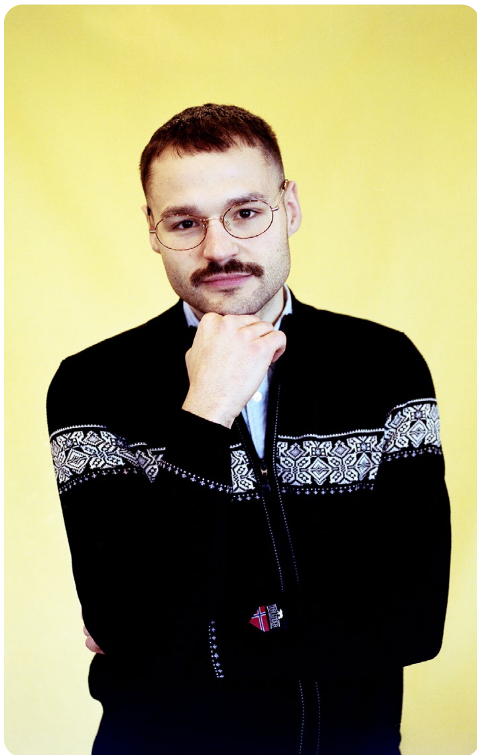
MODEL 648 COL 4 BLACK