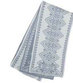
MODEL 292 COL 1 WHITE / GEREY

Size ONE SIZE Gauge 5 GG Stitch Tubular bed jacquard Yarn 100% worsted wool