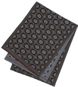
MODEL 227 COL 4 BLACK