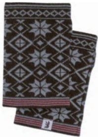
MODEL 228 COL 4 BLACK