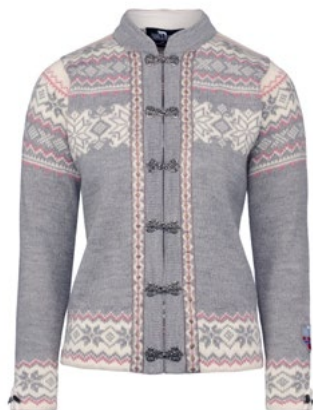
MODEL 640 COL 10 GREY / PINK