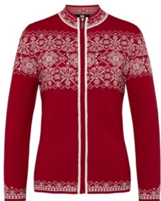
MODEL 627 COL 3 RED