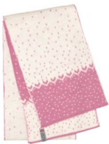
MODEL 249 COL 19 PINK