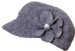
MODEL 284 COL 10 GREY

Size 57 cm Fabric 65% wool, 35% polyester