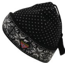
MODEL 401 COL 4 BLACK / WHITE