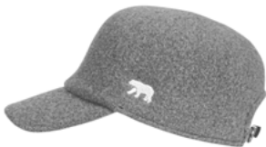
MODEL 282 COL 10 GREY