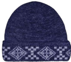
MODEL 206 COL 14 NAVY

Size ONE SIZE Gauge 7 GG Stitch Single bed jacquard Yarn 100% worsted wool