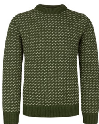
MODEL 379 COL 13 GREEN