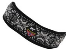
MODEL 402 COL 4 BLACK / WHITE