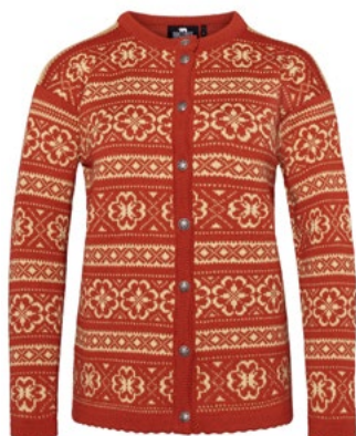
MODEL 620 COL 3 RED