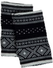
MODEL 246 COL 4 BLACK