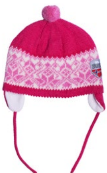
MODEL 257 COL 21 CERISE