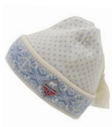
MODEL 401 COL 1 WHITE / BLUE