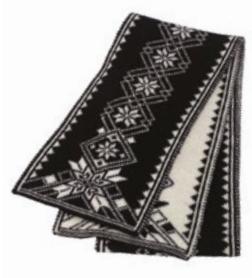
MODEL 292 COL 4 BLACK / WHITE