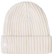
MODEL 272 COL 1 WHITE

Size ONE SIZE Gauge 7 GG Stitch Rib knit Yarn 100% extra fine merino wool