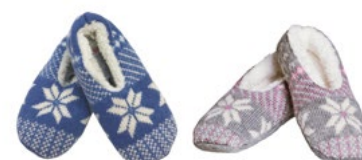
MODEL 254 COL 12 BLUE COL 19 PINK