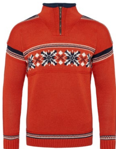
MODEL 329 COL 3 RED