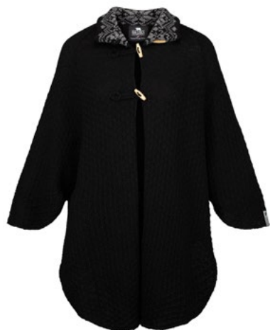
MODEL 605 COL 4 BLACK