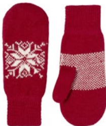
MODEL 405 COL 3 RED / WHITE