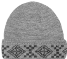
MODEL 206 COL 10 GREY