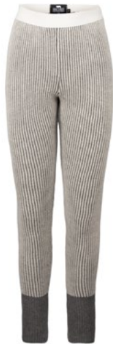
MODEL 469 COL 10 GREY