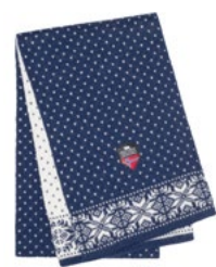
MODEL 404 COL 14 NAVY