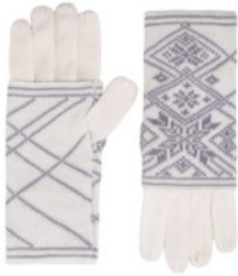
MODEL 293 COL 1 WHITE / GEREY