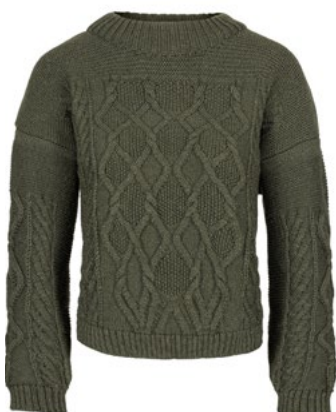
MODEL 381 COL 13 GREEN