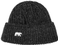
MODEL 238 COL 9 CHARCOAL