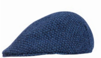
MODEL 269 COL 12 BLUE

Size 58 CM Fabric 35% wool, 65 % polyester