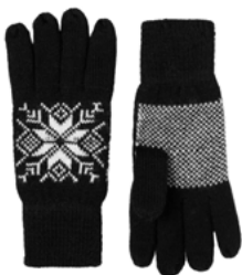
MODEL 403 COL 4 BLACK / GREY