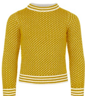
MODEL 563 COL 18 OCHRE / OFF-WHITE