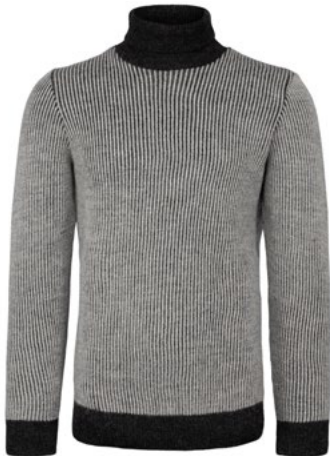
MODEL 369 COL 9 CHARCOAL

Rib-knitted wool sweater, longs and balaclava. The perfect set for your next outdoor winter adventure. Durable products made of Norwegian wool.