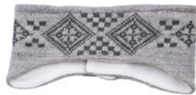
MODEL 207 COL 10 GREY