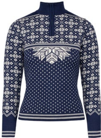
MODEL 335 COL 14 NAVY