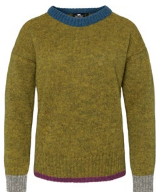
MODEL 357 COL 13 GREEN