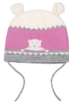
MODEL 235 COL 19 PINK