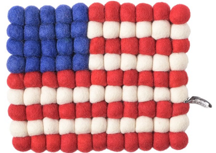
NEW USA Flag 131310 PRE-ORDER

Materials: 100% wool, azo-free colors, certified wool, fsc-certified paper, recycled paper and organic cotton. 100% natural, renewable and biodegradable.