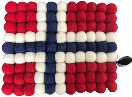
Norway Flag 131499