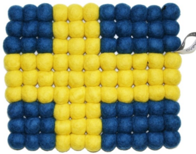
Sweden Flag 131588