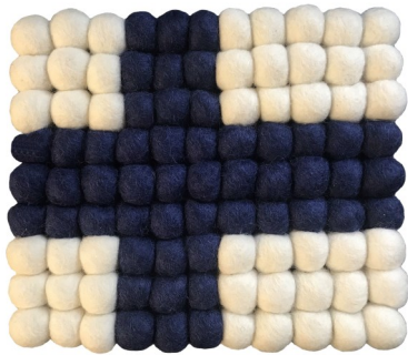
Finland / Finnish Flag 131590