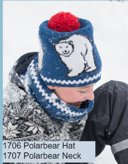
1706 Polarbear Hat 1707 Polarbear Neck