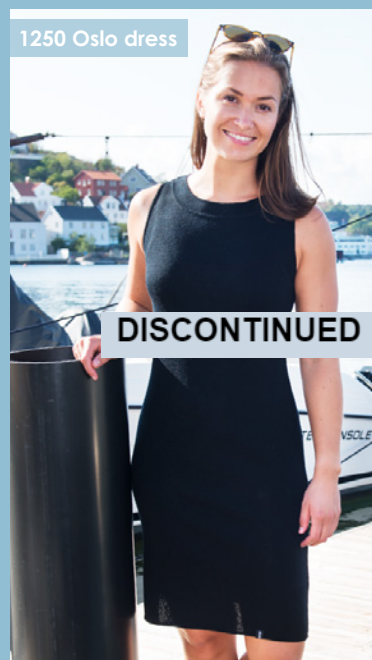
1250 Oslo dress