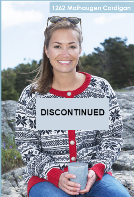
1262 Maihaugen Cardigan