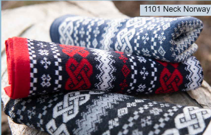
1101 Neck Norway