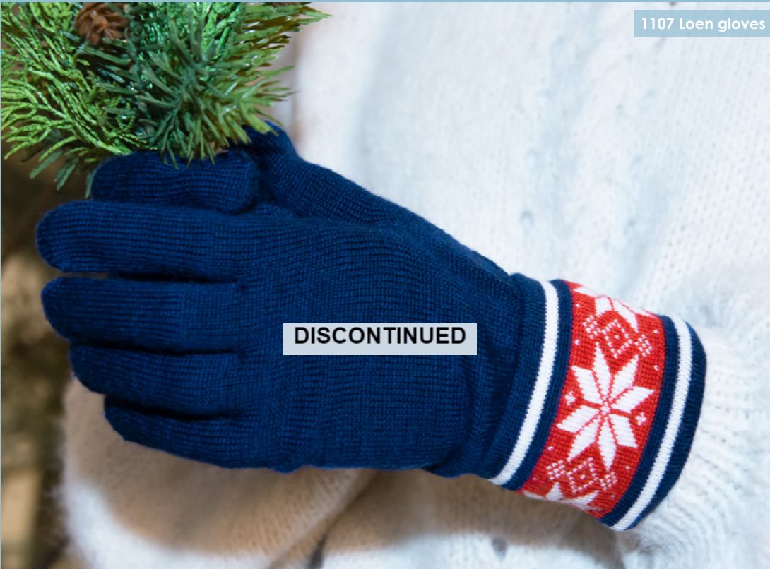
1107 Loen gloves