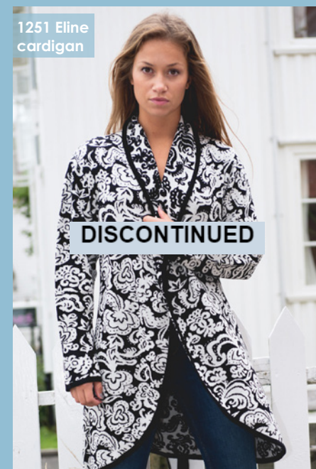
1251 Eline cardigan