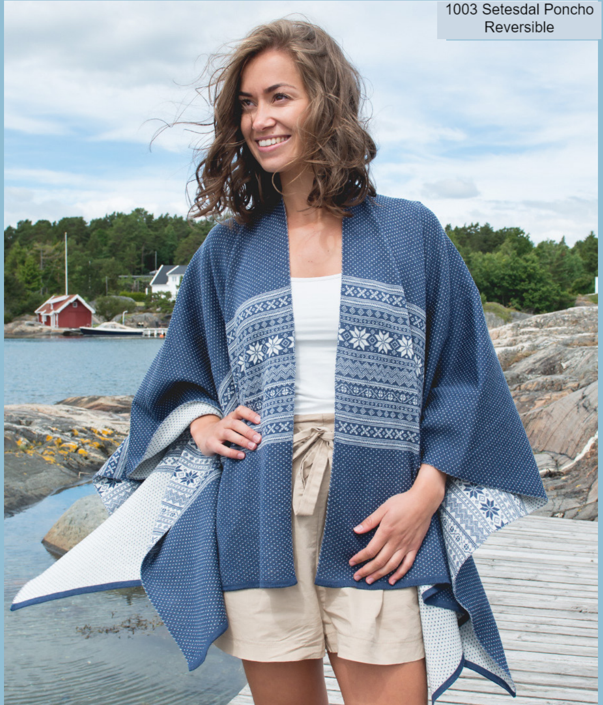
1003 Setesdal Poncho Reversible

1003 Setesdal Poncho colors: Black, Light Grey, Denim Blue