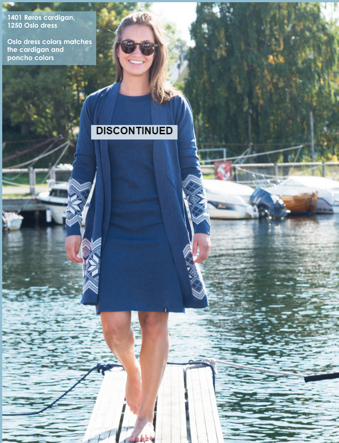
1401 Røros cardigan, 1250 Oslo dress

Oslo dress colors matches the cardigan and poncho colors