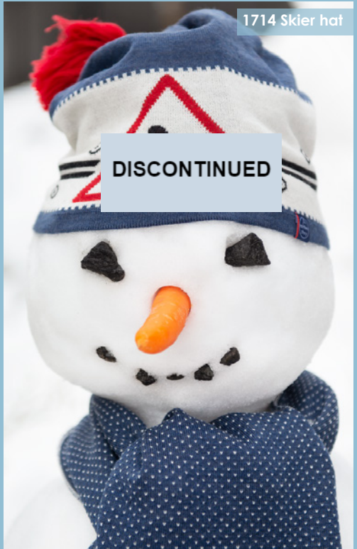
1714 Skier hat