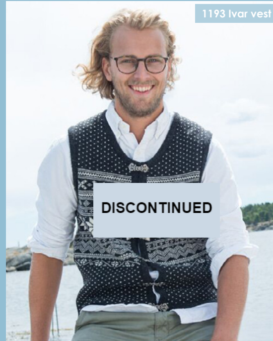
1193 Ivar vest