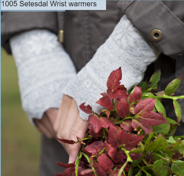
1005 Setesdal Wrist warmers