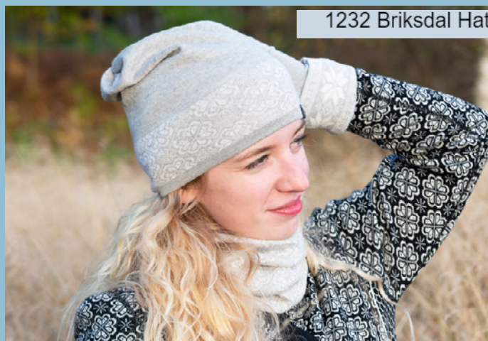
1232 Briksdal Hat

The Briksdal design is available in Black, Burgundy, Light Grey & Denim Blue.