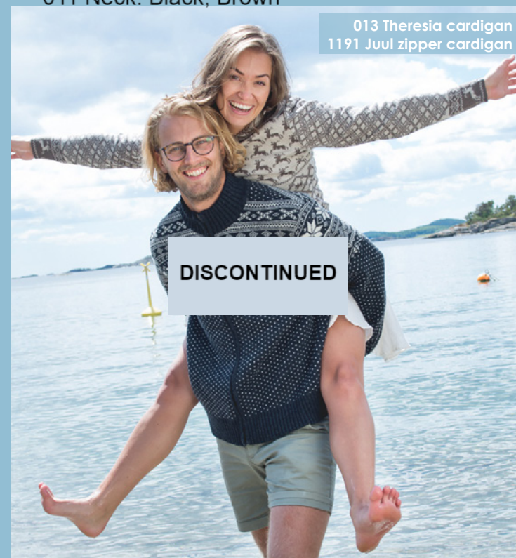
013 Theresia cardigan 1191 Juul zipper cardigan