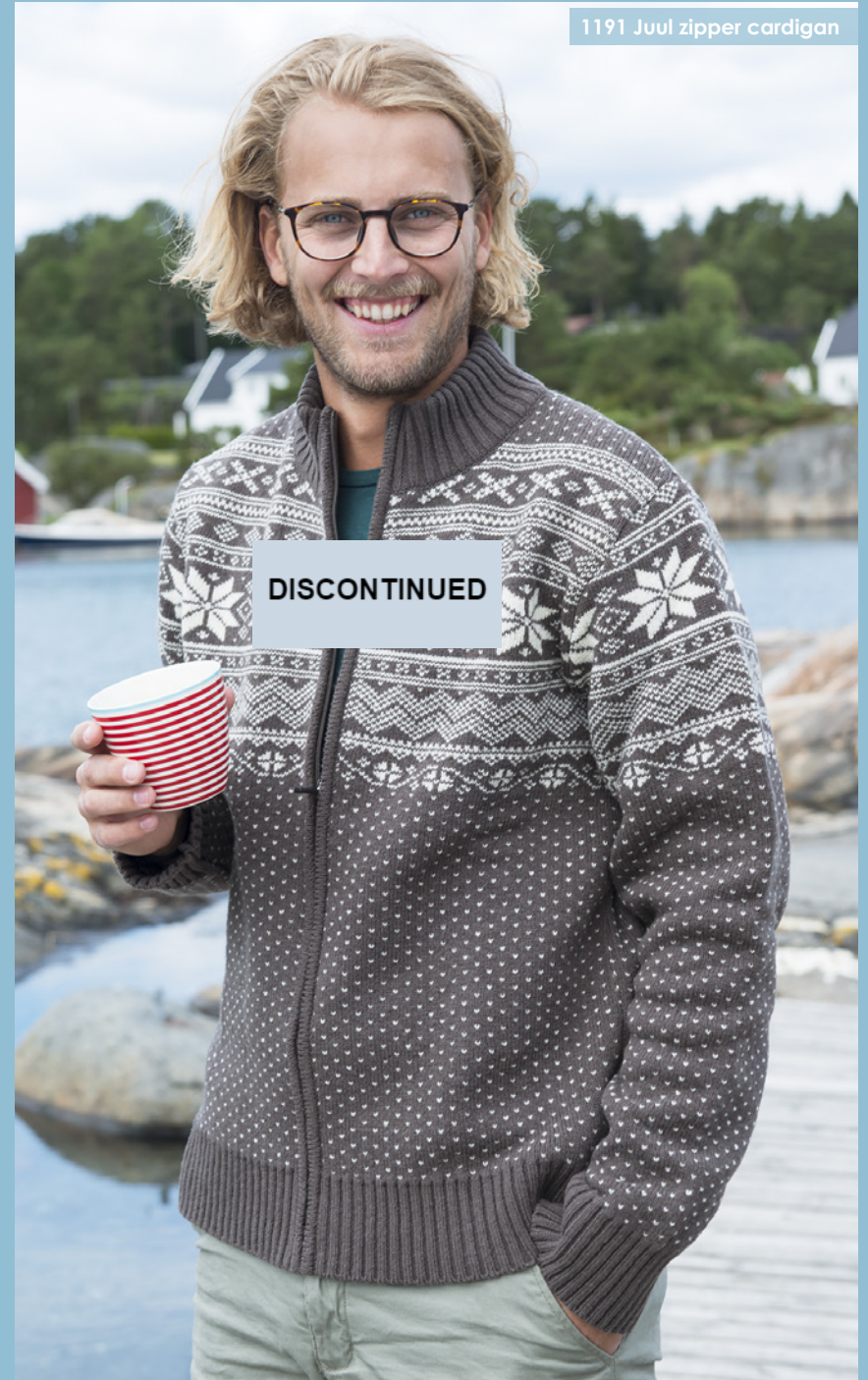
1191 Juul zipper cardigan