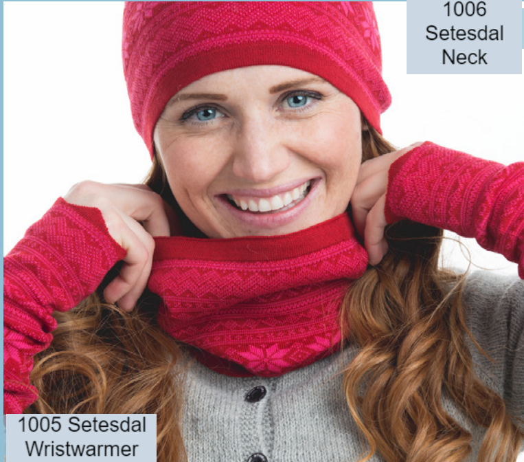
1006 Setesdal Neck