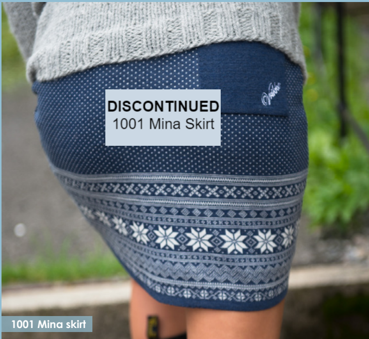
1001 Mina skirt