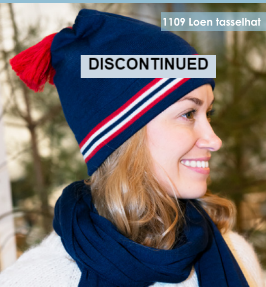
1109 Loen fasselhat