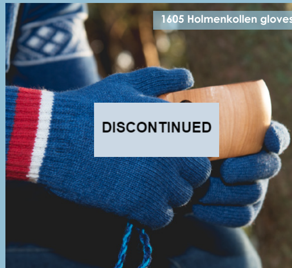
1605 Holmenkollen gloves