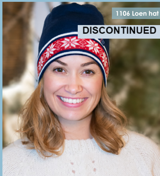
1106 Loen hat