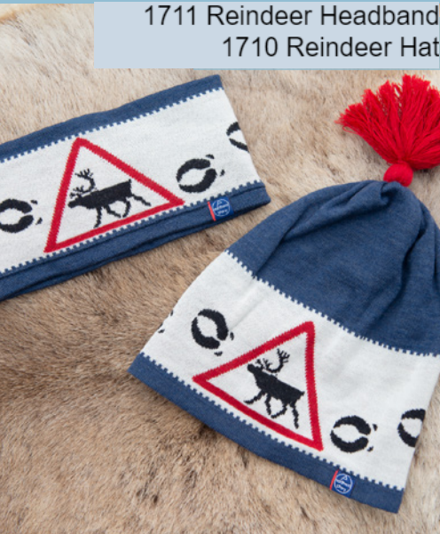
1711 Reindeer Headband 1710 Reindeer Hat