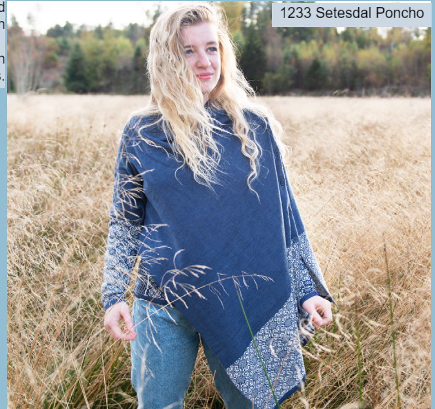
1233 Setesdal Poncho

The Briksdal styles can be used on both sides.