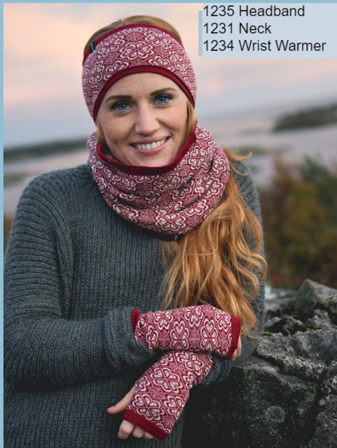
1235 Headband 1231 Neck 1234 Wrist Warmer