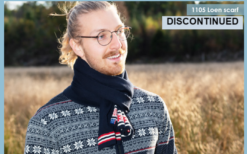
1105 Loen scarf