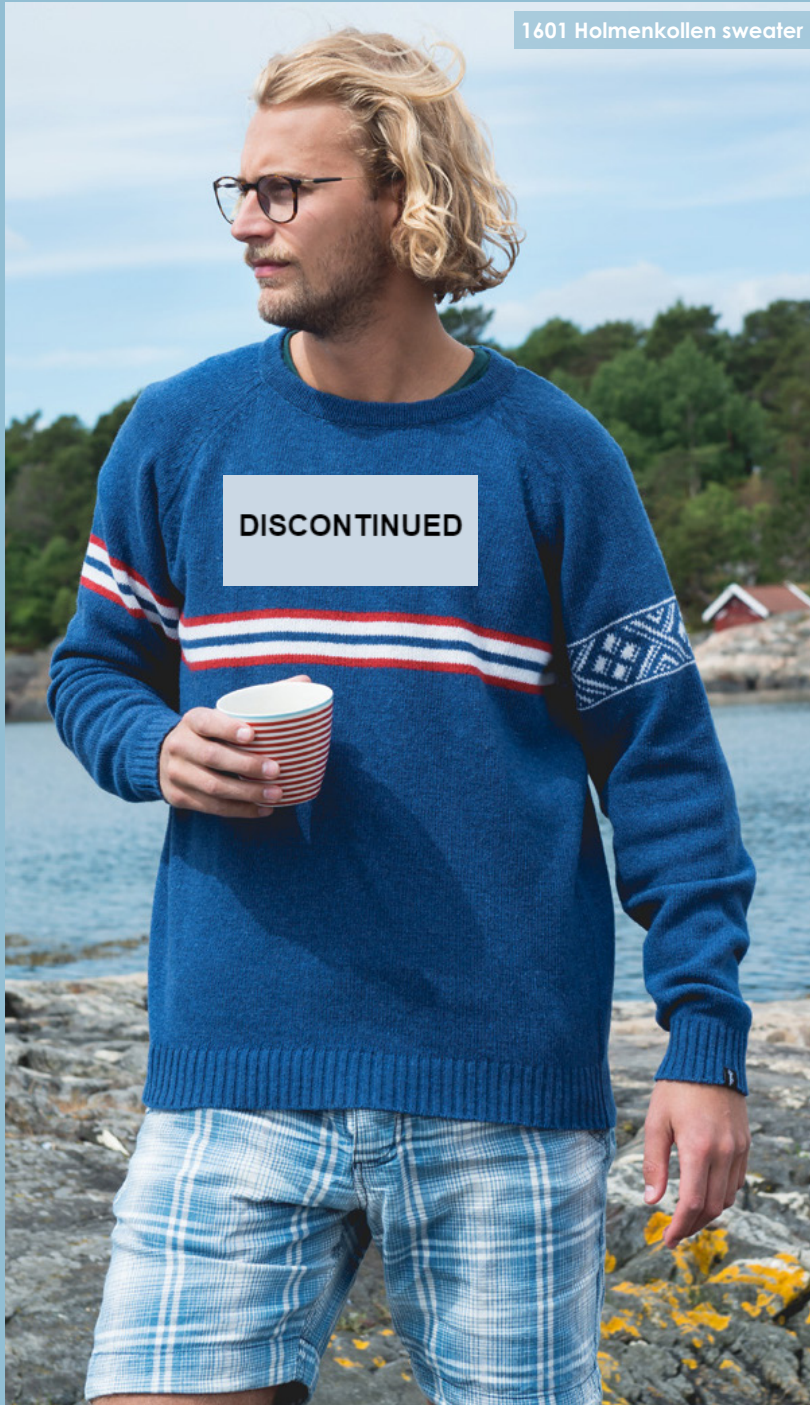
1601 Holmenkollen sweater