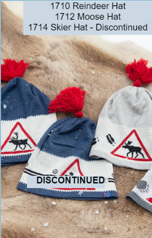
1710 Reindeer Hat 1712 Moose Hat 1714 Skier Hat - Discontinued