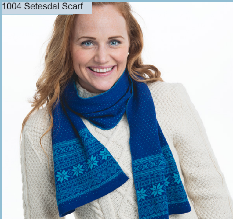
1004 Setesdal Scarf