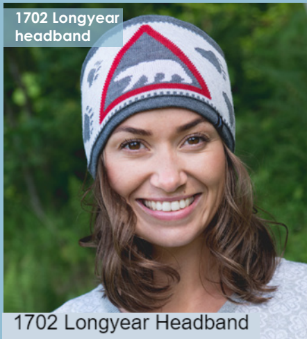
1702 Longyear headband