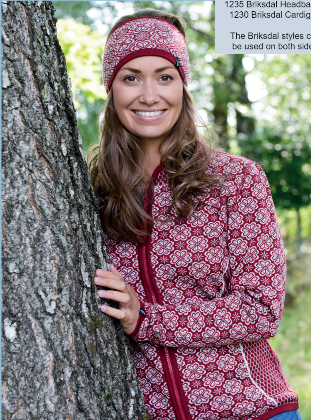
1235 Briksdal Headband 1230 Briksdal Cardigan

The Briksdal styles can be used on both sides.