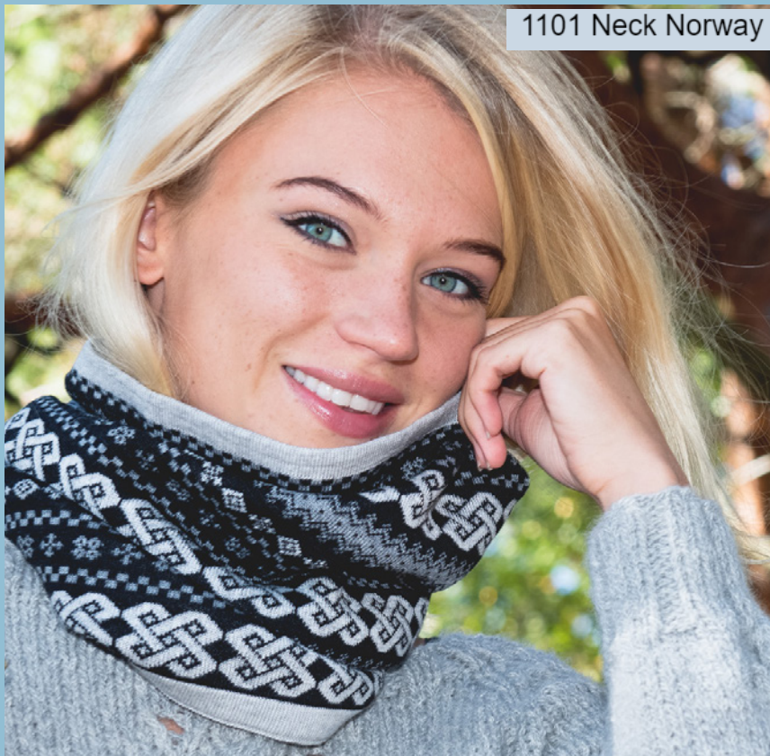
1101 Neck Norway