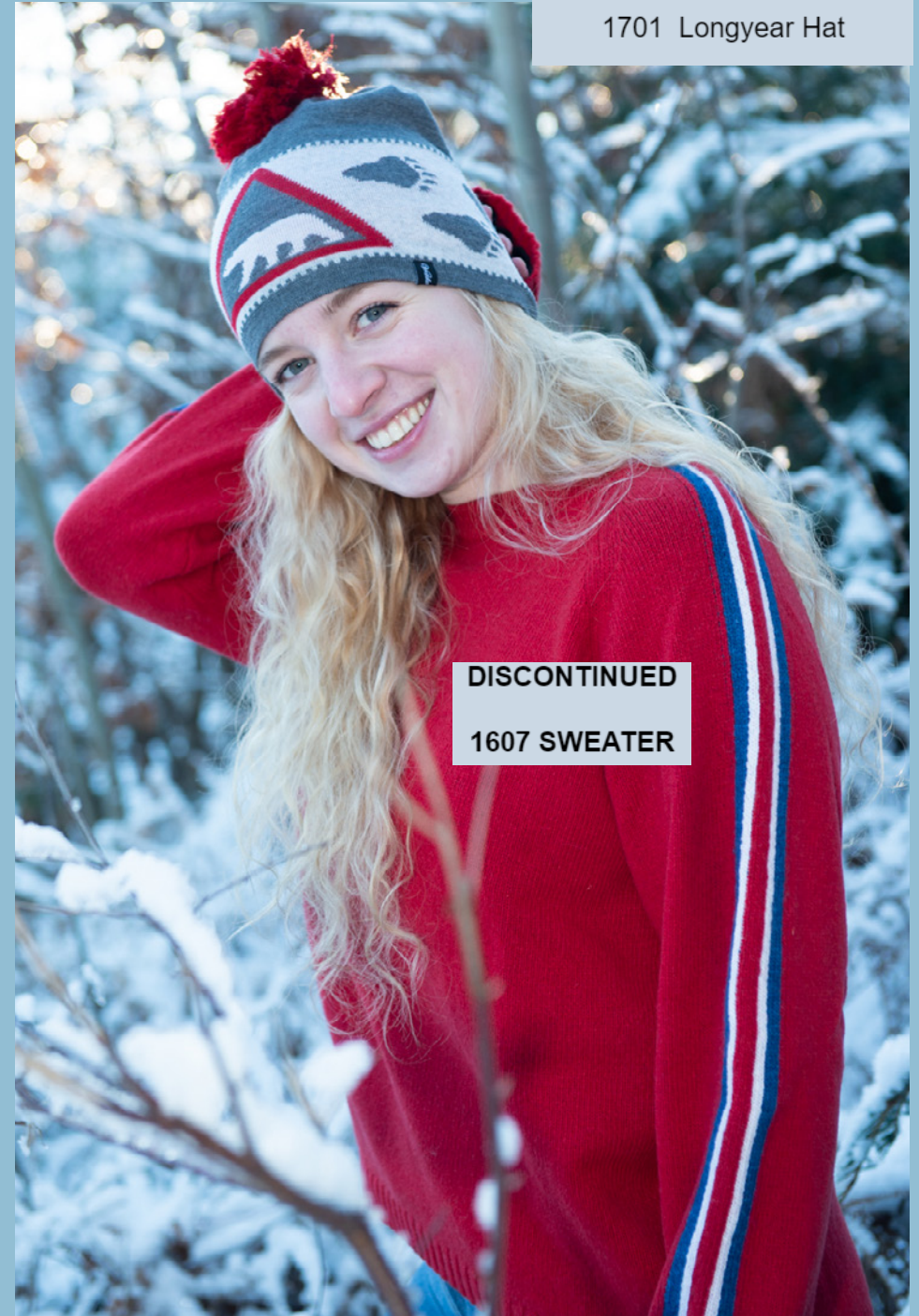
1701 Longyear Hat

1609 CHILDREN'S SWEATER 1301 UT PÅ TUR HAT