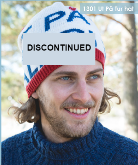
1301 Ut På Tur hat