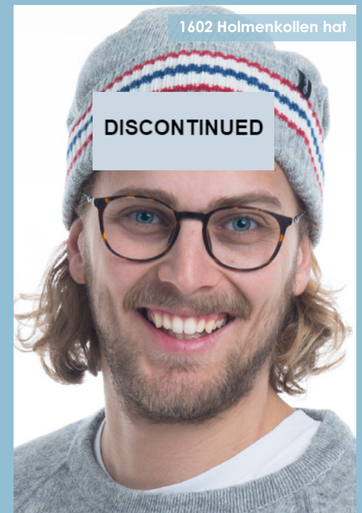
1602 Holmenkollen hat