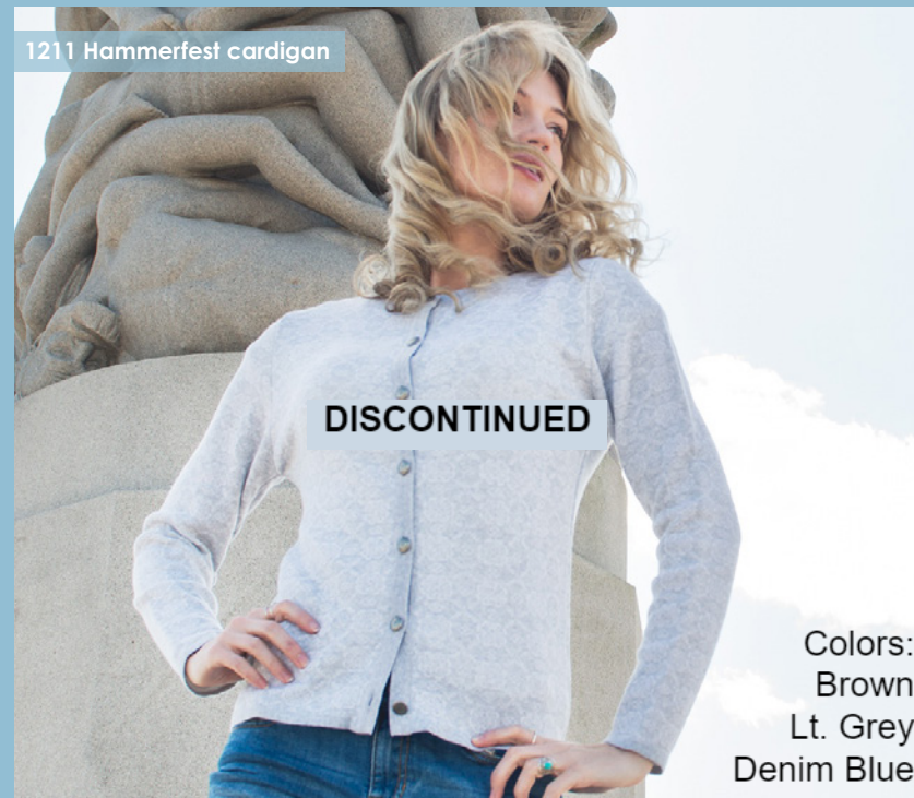
1211 Hammerfest cardigan