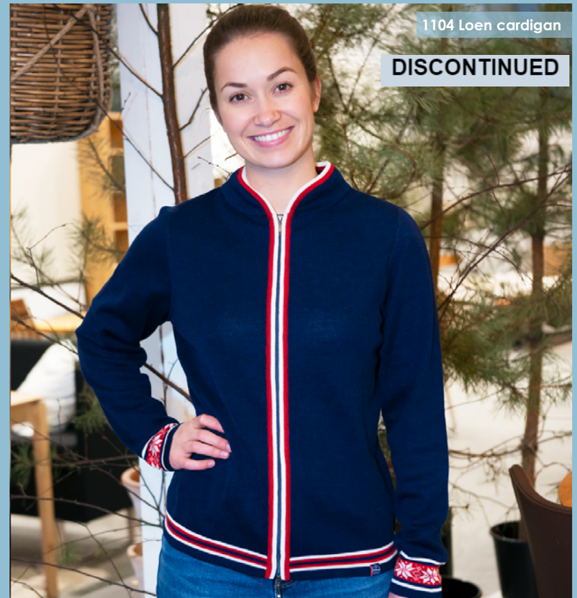
1104 Loen cardigan