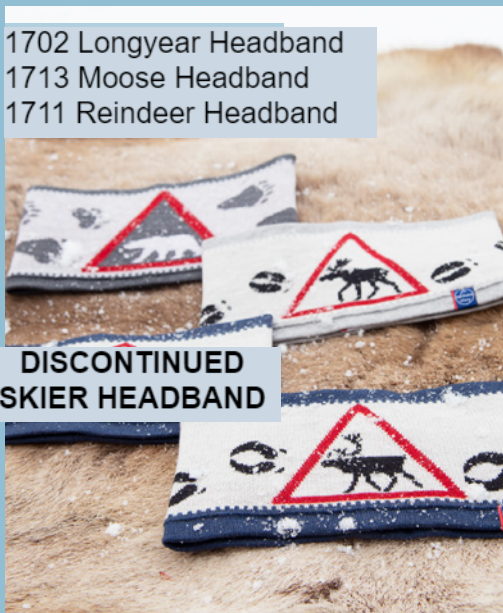
1702 Longyear Headband 1713 Moose Headband 1711 Reindeer Headband