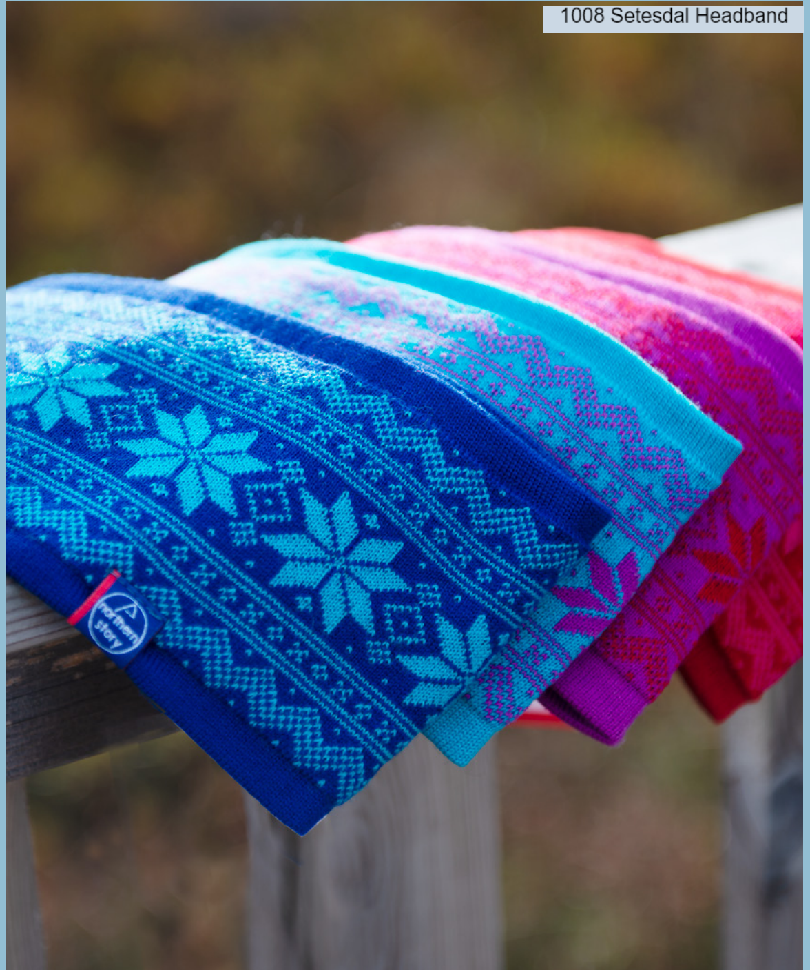
1008 Setesdal Headband

Setesdal Accessory Colors: Black, Light Grey, Red, Denim Blue, Blue/Turquoise, Red/Pink, Blue/Purple and Purple/Red