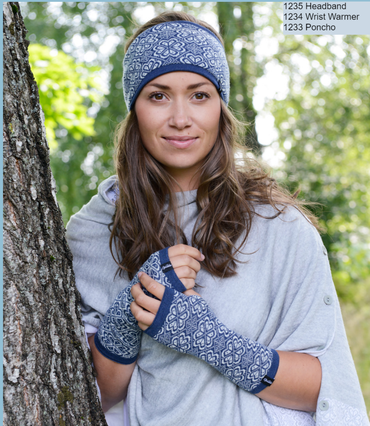
1235 Headband 1234 Wrist Warmer 1233 Poncho