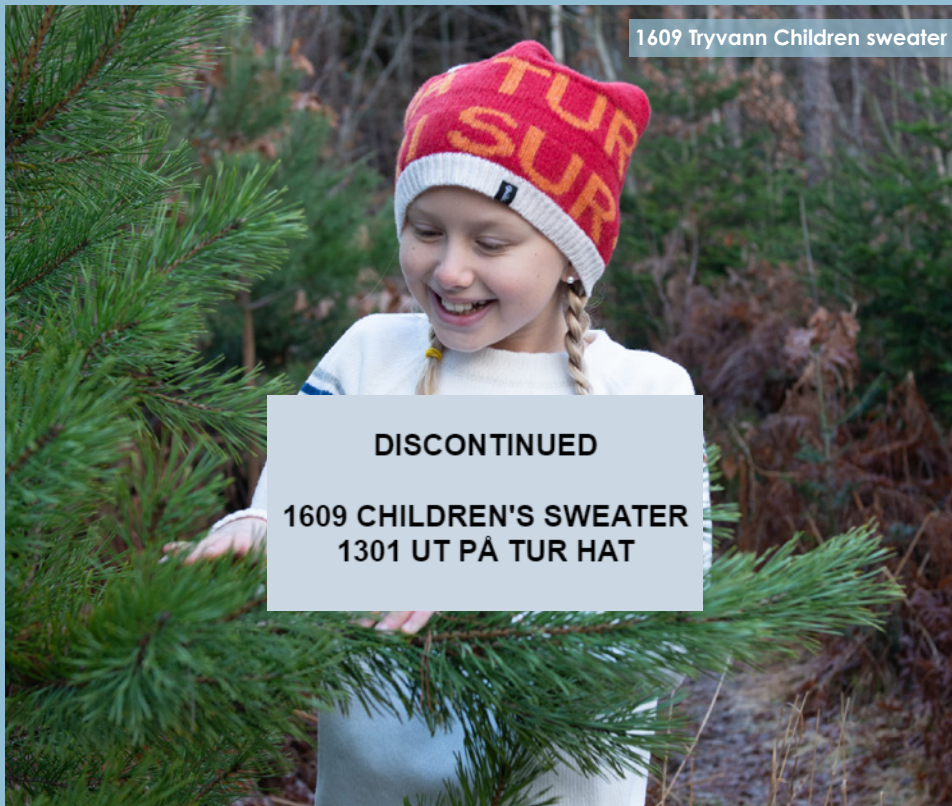
1609 Tryvann Children sweater