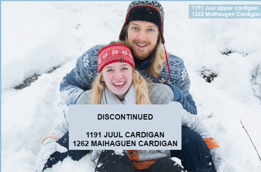
1191 Juul zipper cardigan 1262 Maihaugen Cardigan