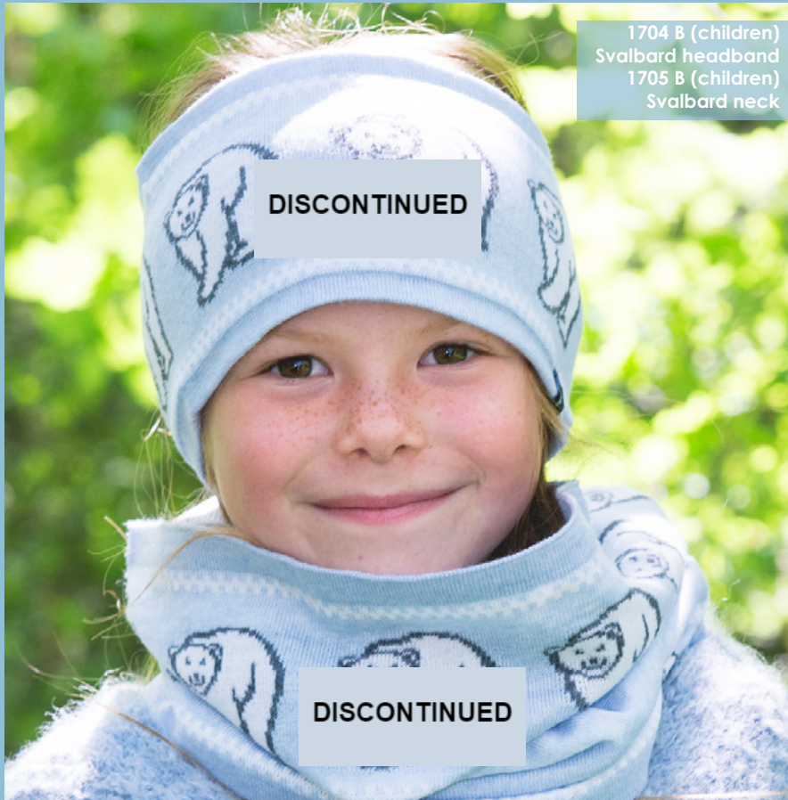
1704 B (children) Svalbard headband 1705 B (children) Svalbard neck